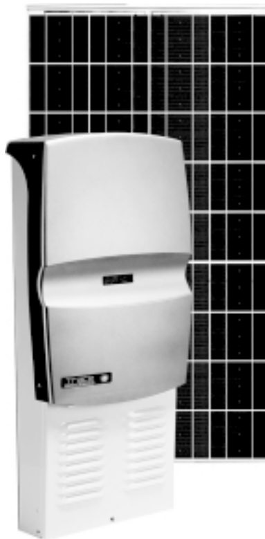
ST Series Inverter*

* The Sun Tie is shown with optional protective rain shield which is required for outdoor installation of the inverter.